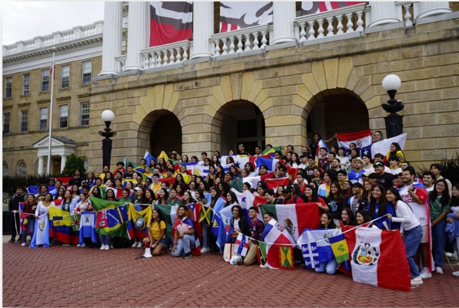
University of Wisconsin-Madison students celebrate the start of Hispanic Heritage Month.

The Madison, Wisconsin metro area has a thriving Latino community of about 40,000 people identifying as Hispanic, according to the US Census Bureau .