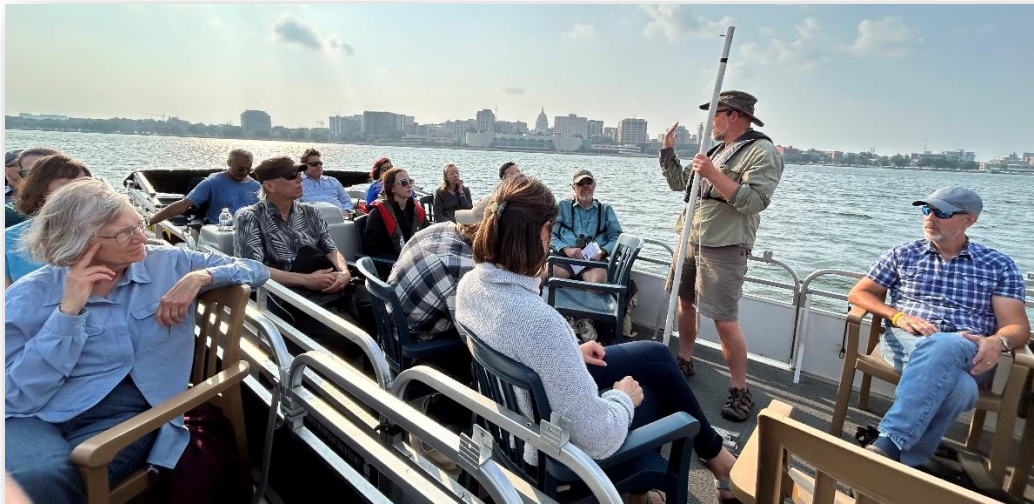
CARPC staff and commissioners on a water quality tour of Dane County lakes