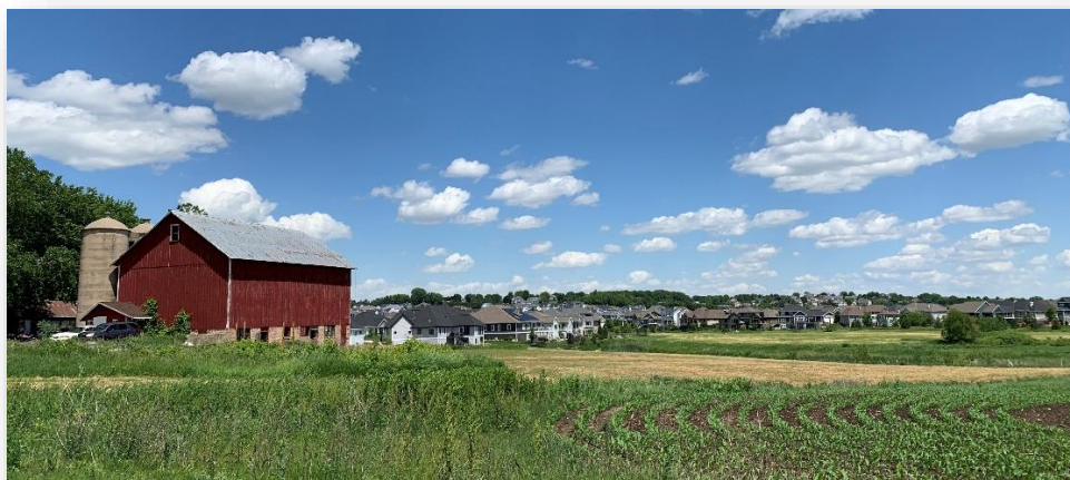
Village of Waunakee, Dane County

The Capital Area Regional Planning Commission (CARPC) is an independent governmental agency established in 2007 to coordinate planning and development among municipalities in Dane County, Wisconsin (the county where Madison, the state capital, is located). CARPC develops and promotes regional plans, provides objective information, and supports local planning efforts. CARPC is legally responsible for two main regional planning endeavors for the Dane County region: land use planning and areawide water quality management planning.