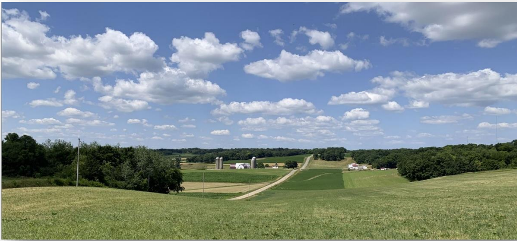
Town of Springfield, Dane County

Dane County is the beating heart of south-central Wisconsin. Dane County's 1,197 square miles are characterized by a varied landscape that includes rolling hills, lakes, and fertile farmland.