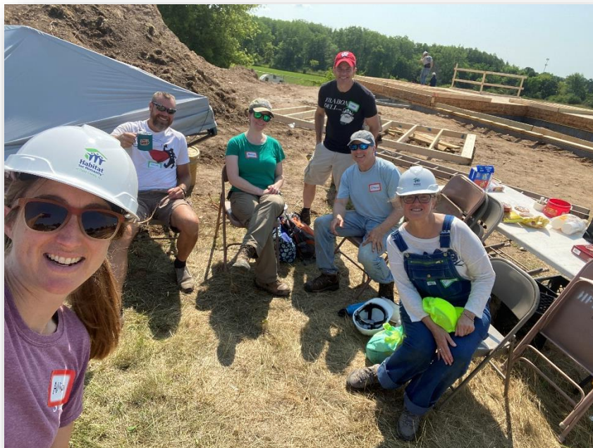
CARPC staff on a Habitat for Humanity build day