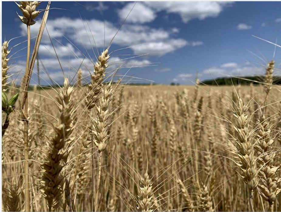
Town of Springfield, Dane County

As an employer, the Capital Area Regional Planning Commission strives to provide a work environment where diversity and differing opinions are valued, creativity is encouraged, continuous learning and improvement are fostered, teamwork and open/honest communication are encouraged, and meeting customer needs through quality service is a shared goal. All employees must be able to demonstrate multicultural competence – the awareness, knowledge, and skills needed to work with others who are culturally different from self in meaningful, relevant, and productive ways. Applicants from traditionally underrepresented populations including women, racial and ethnic minorities, and persons with disabilities are especially encouraged to apply.