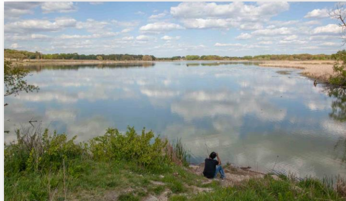
Cherokee Lake, Dane County

CARPC's excellent employee benefits include employer-subsidized group health and dental plans, with 100% of employee and family HMO premiums covered; life and disability insurance; a retirement plan in the best-in-class Wisconsin Retirement System (WRS) with a generous employer match; flexible spending plan; and generous paid time off.