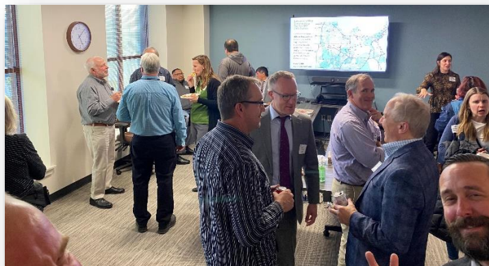
CARPC / Greater Madison MPO open house