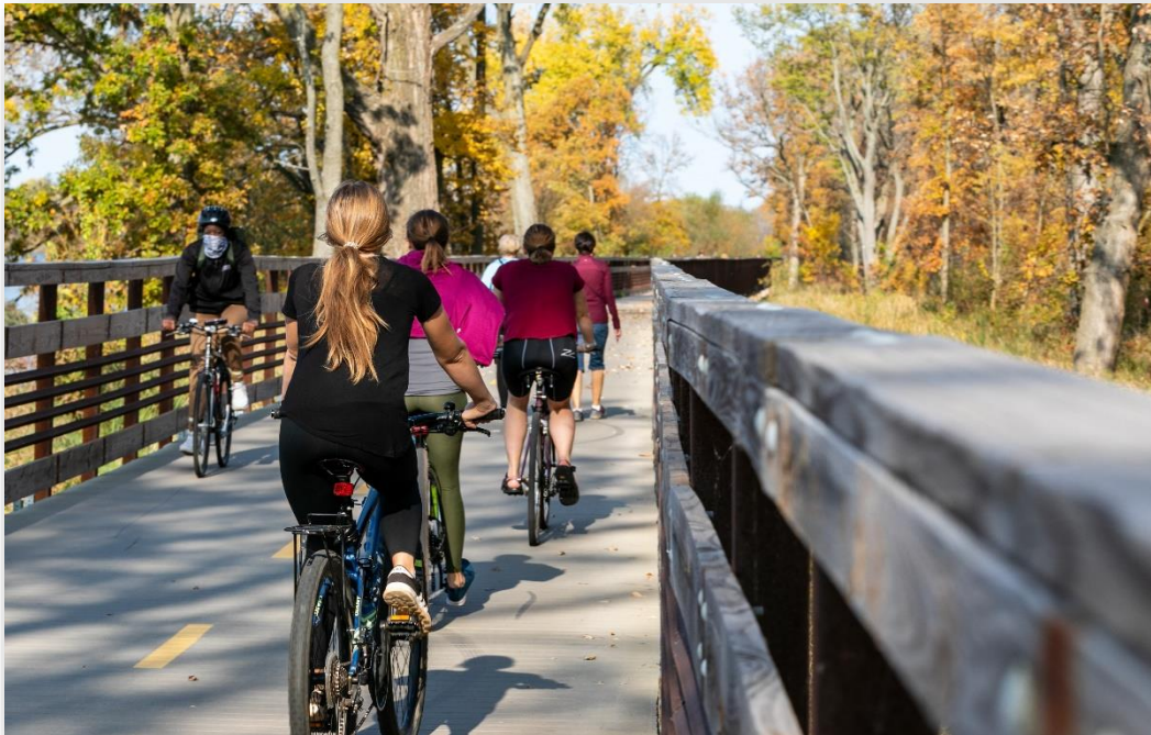
The Lower Yahara River Trail in McFarland, Dane County

Dane County's racial and ethnic demographics : 78% non-Hispanic White, 7% Asian, 7% Hispanic or Latino, 6% Black.