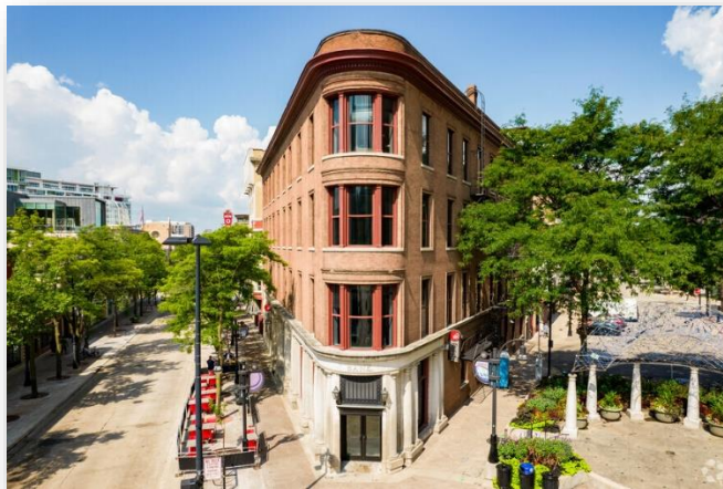
The historic 100 State Street building in downtown Madison, home of the CARPC office

CARPC serves Dane County, Wisconsin, with an office located in downtown Madison.