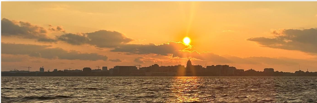
The downtown Madison skyline and State Capitol dome seen from Lake Monona, one of Dane County’s chain of scenic lakes

The Dane County seat, Madison, has a population of over 250,000 residents. Madison is the capital of Wisconsin, a world-class research & technology university city, and a thriving creative-class hub.